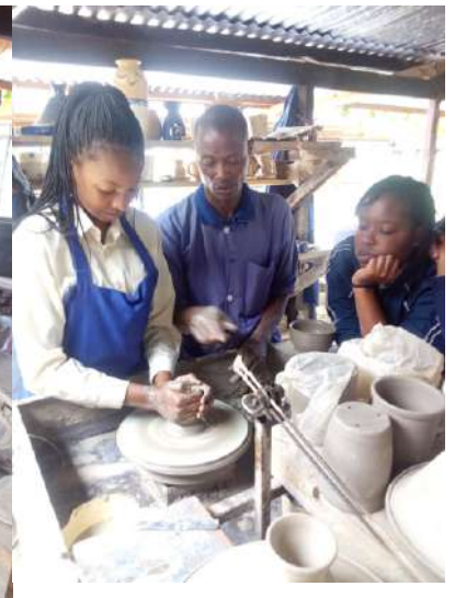
Art class trip