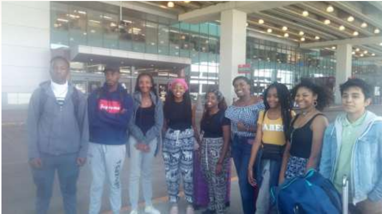
Westminster cohort at the Airport