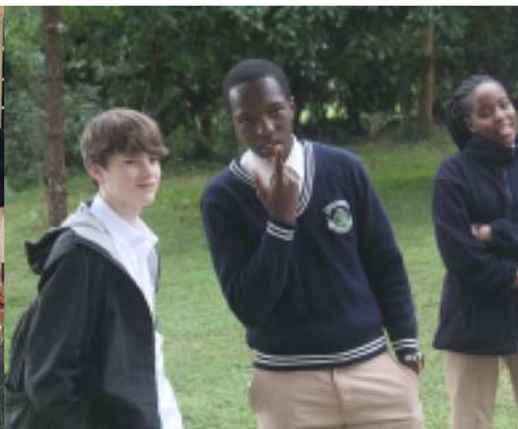
The Westminster group leaving our Campus

Our partnership with Ardingly college UK continued to provide us with opportunities to strengthen our programmes through training, peer evaluation and sharing good practice. We were privileged to host two students from the US for the Summer programme. We were privileged to host two students from the US for the Summer programme. Their interaction with our students enriched their global outlook.