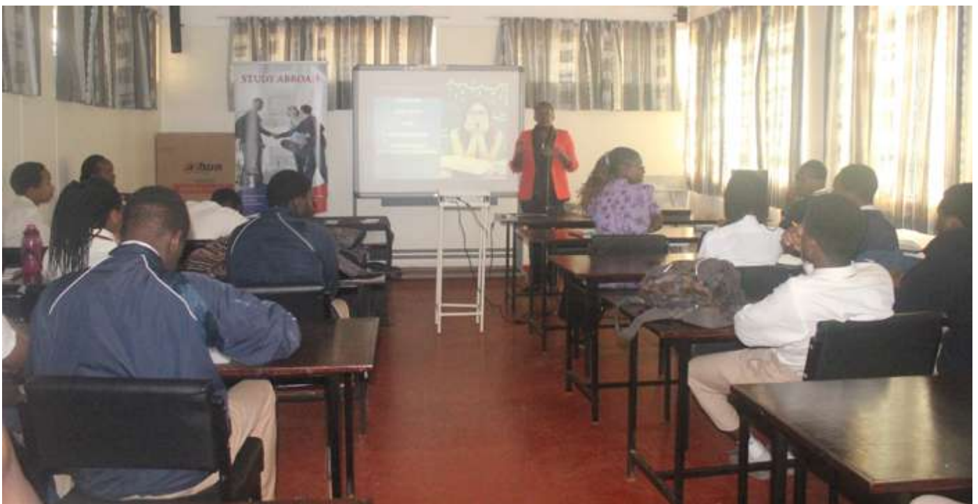
An information session during the Annual Career Fair, June 2019

The department is also keen to broaden the students' awareness about the world of work, exposing them to information to different careers and talks about their goals and aspirations. Every year we host a variety of universities and colleges, both local and international, at our Annual Careers Fair. Students are encouraged to practice their interrogation skills during their interactions with representatives from the different institutions.