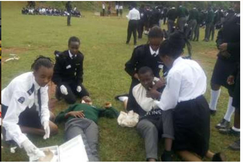
St. John Ambulance